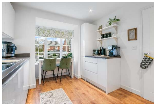
Living Room/Dining Room Measurements 23' 11" x 11' 0" (7.30m x 3.36m)

Step into the spacious elegance of your home, where the warm allure of wood effect laminate flooring sets the stage for refined living. As you enter, your gaze is drawn to a large, double-glazed window, framing picturesque views of the lush greenery and natural beauty that surrounds your tranquil oasis. Adjacent to the window, patio doors beckon you to step outside and immerse yourself in the tranquillity of the enclosed rear garden.