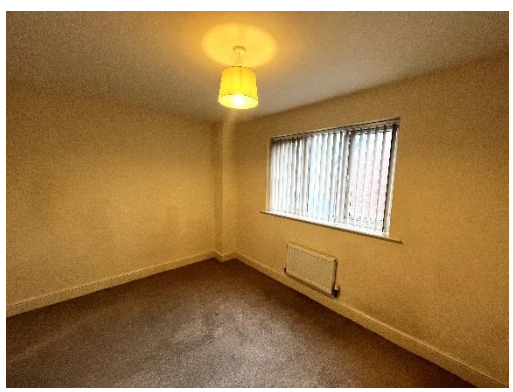
Bedroom 3 Measurements: 9' 11" x 5' 7" (3.02m x 1.69m)

Having carpet flooring, radiator and double glazed window overlooking the front.