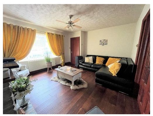
Kitchen / Dining Room

Measurements: 17' 8" x 9' 0" (5.39m x 2.75m)